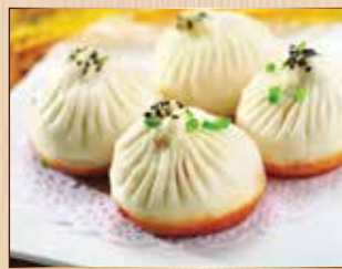
Pan Fried Bun