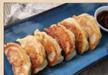
Pan Fried Dumpling