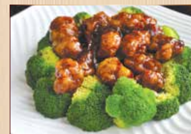
General Tso's Chicken