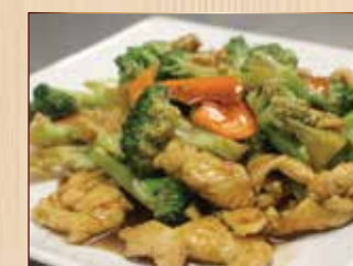
Chicken w. Broccoli