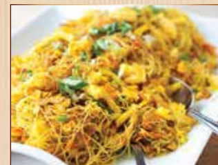
Singapore Mei Fun