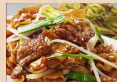
Beef Chow Fun