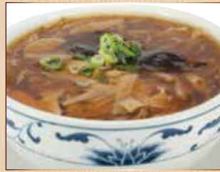
Hot & Sour Soup