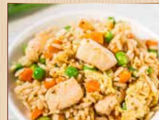
Chicken Fried Rice