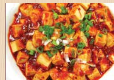
Ma Po Tofu