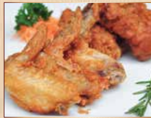
Fried Chicken Wings