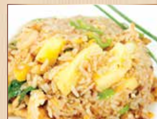
Pineapple Fried Rice