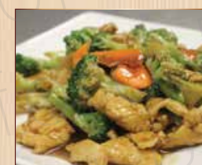
Chicken w. Broccoli