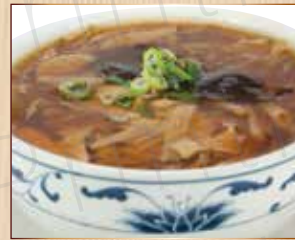
Hot & Sour Soup