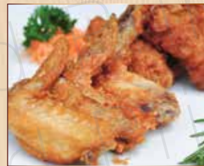
Fried Chicken Wings