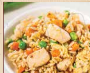
Chicken Fried Rice