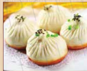
Pan Fried Bun