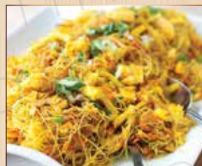
Singapore Mei Fun