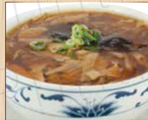
Hot & Sour Soup