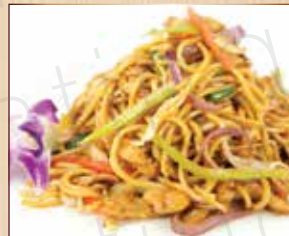
Chicken Lo Mein