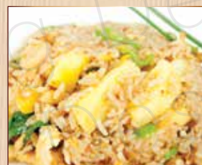
Pineapple Fried Rice