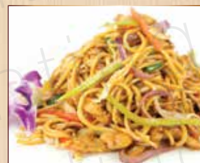
Chicken Lo Mein