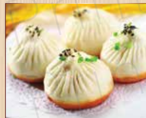
Pan Fried Bun