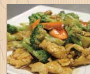
Chicken w. Broccoli