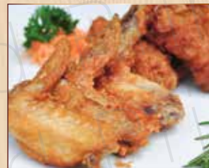
Fried Chicken Wings