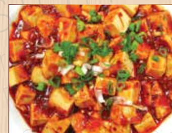
Ma Po Tofu