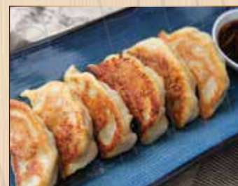
Pan Fried Dumpling