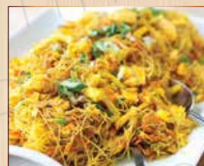
Singapore Mei Fun